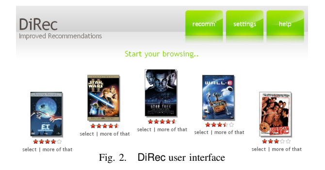
We finally note that CF systems that wish to keep their existing UI may still leverage DiRec by employing it in a "behind the scenes" mode. In this case DiRec 's UI is disabled and DiRec acts as a service which is invoked by system calls.